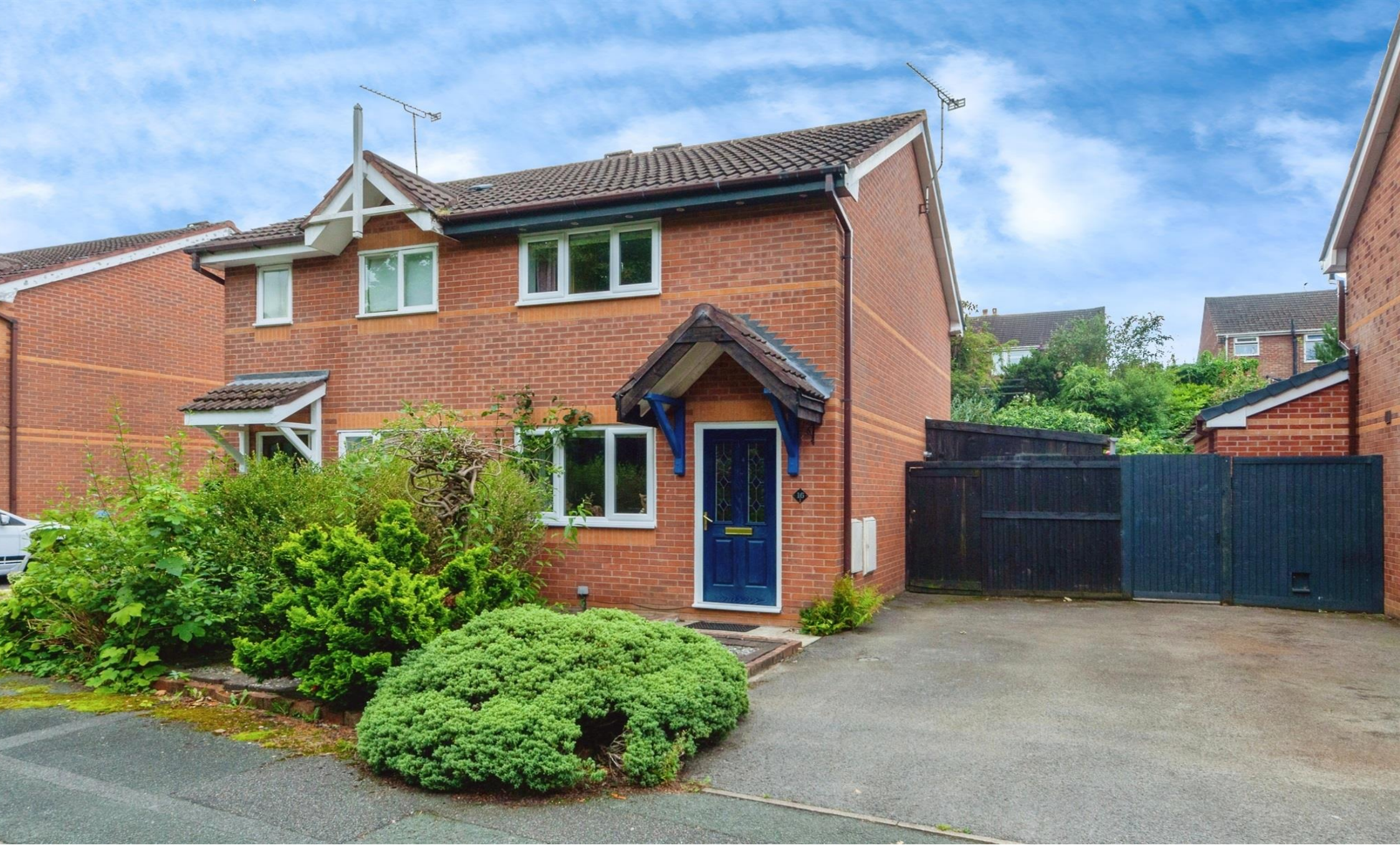
The Glen, Blacon, Chester CH1 5GA