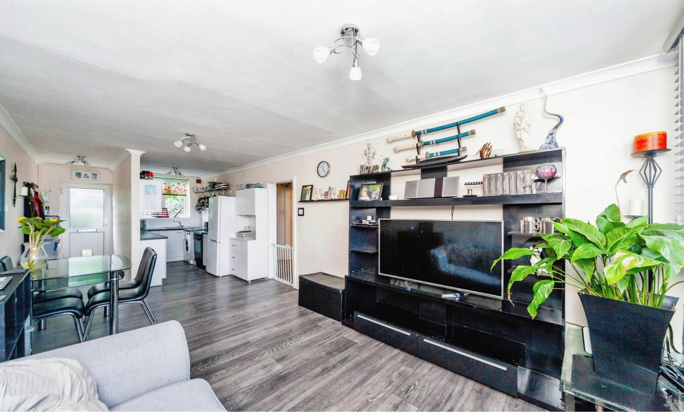
Brook Lane Shops, Brook Lane, Chester CH2 2EB