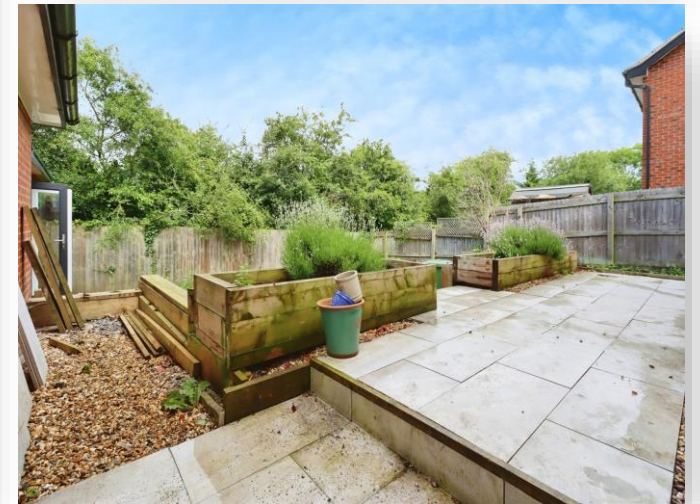
Inveresk Road, Tilston, Malpas SY14 7ED