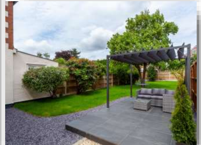
Whitchurch Road, Great Boughton, Chester CH3 5QB