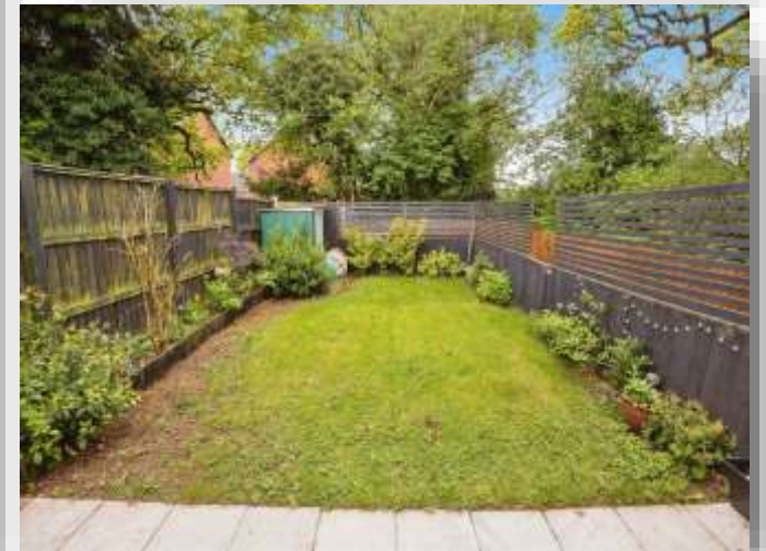
Fieldside, Duddon, Tarporley CW6 0UL