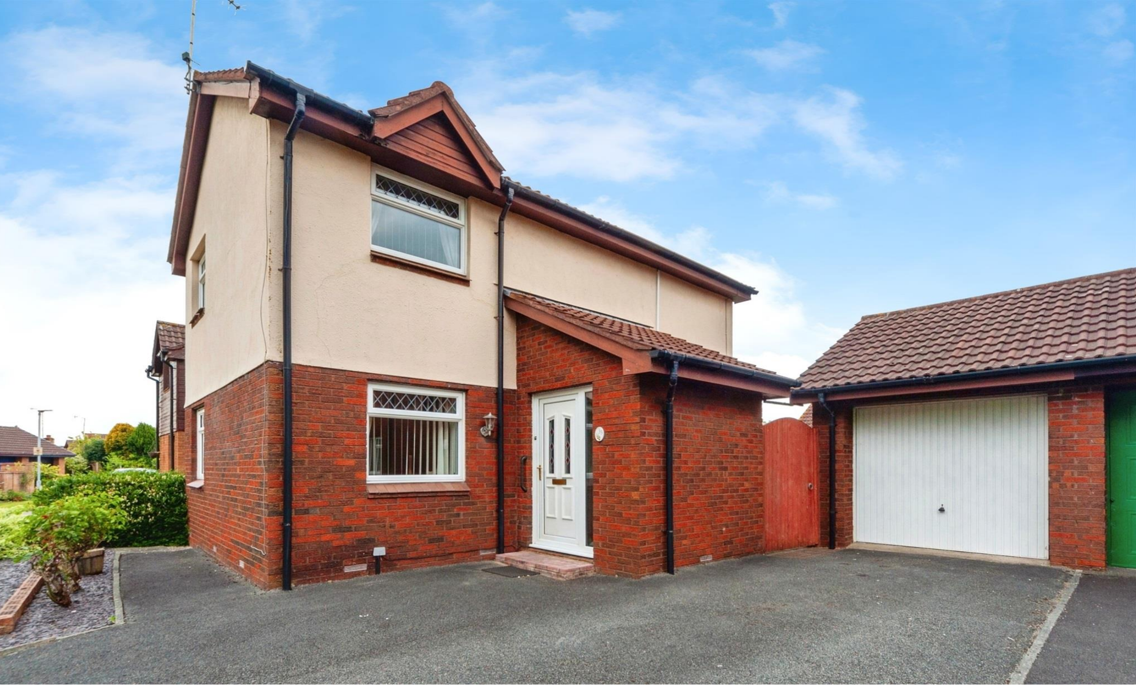
Whites Meadow, Great Boughton, Chester CH3 5SR