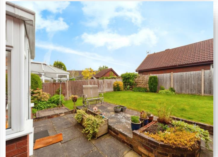
Whites Meadow, Great Boughton, Chester CH3 5SR