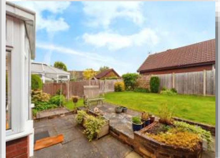
Whites Meadow, Great Boughton, Chester CH3 5SR