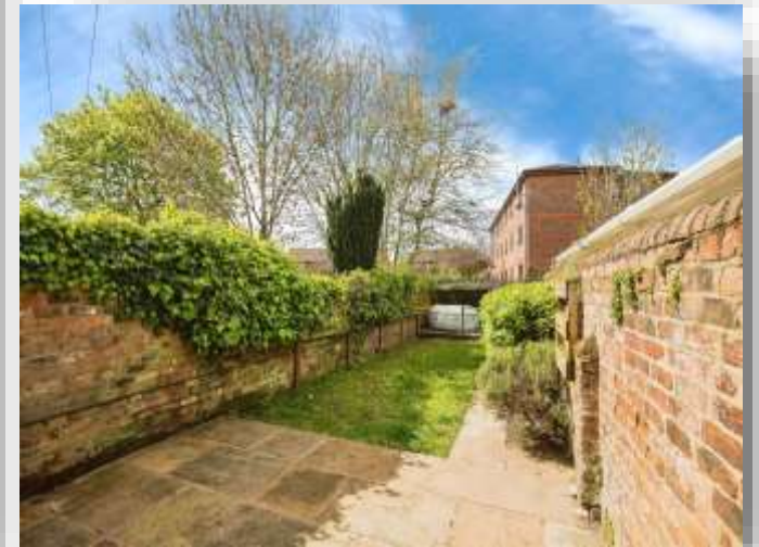
Gladstone Avenue, Chester CH1 4JX