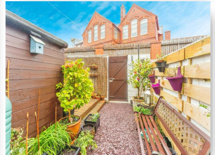
Cherry Road, Chester CH3 5DU