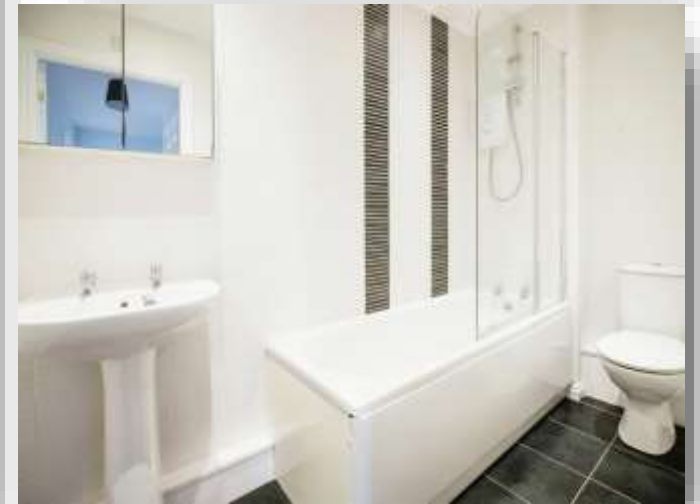
Black Diamond Park, Chester CH1 3ET