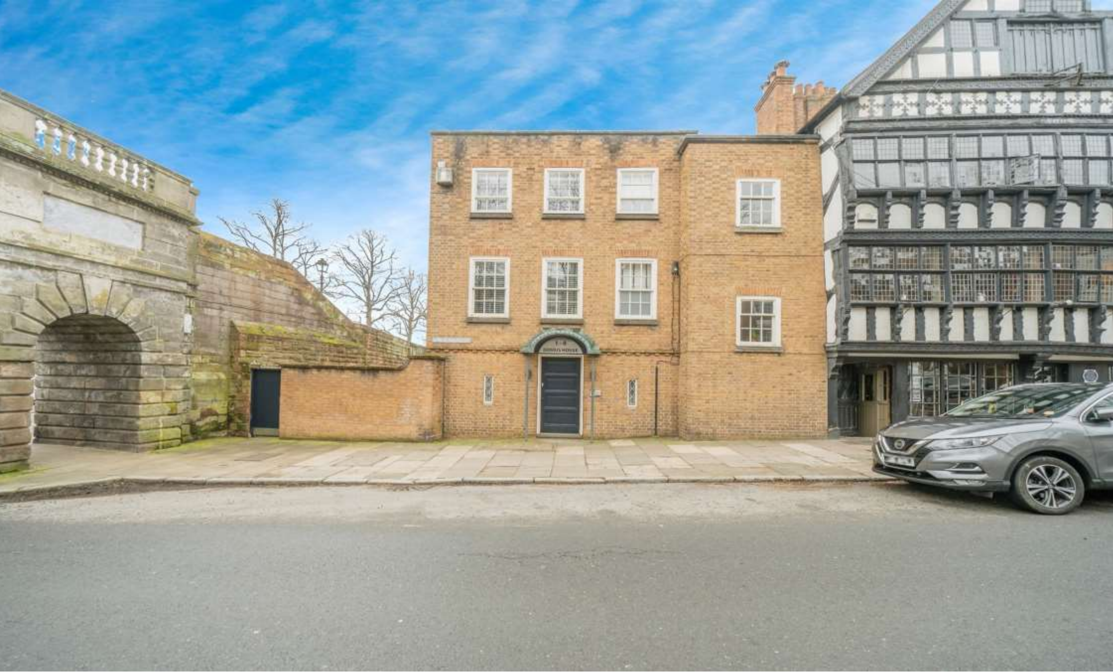
Domus House, Lower Bridge Street, Chester CH1 1RU