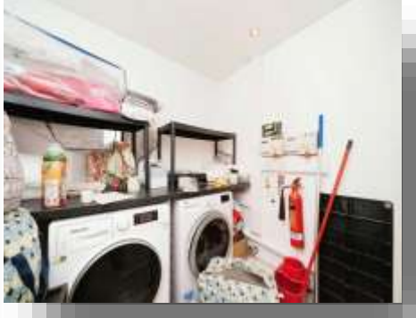
view this property online swetenhams.co.uk/Property/CHS118050