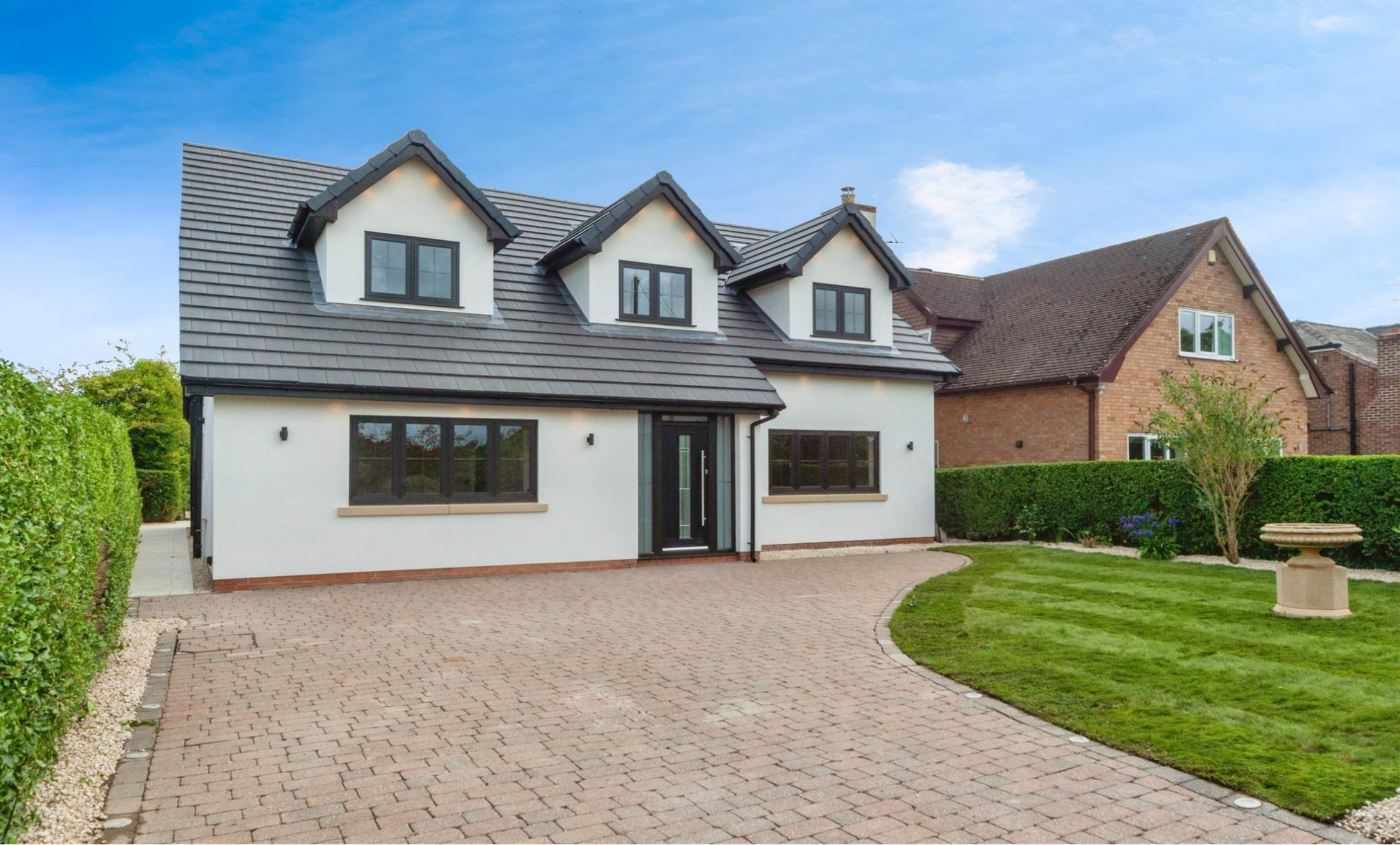
Holly Lodge, Belle Vue Lane, Guilden Sutton, Chester CH3 7EJ