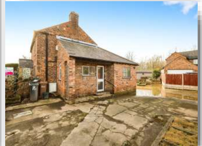
The Farm, Bretton Lane, Bretton, Chester CH4 0DW