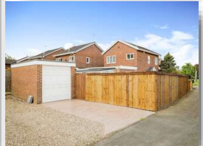
Dee Road, Mickle Trafford, Chester CH2 4DL