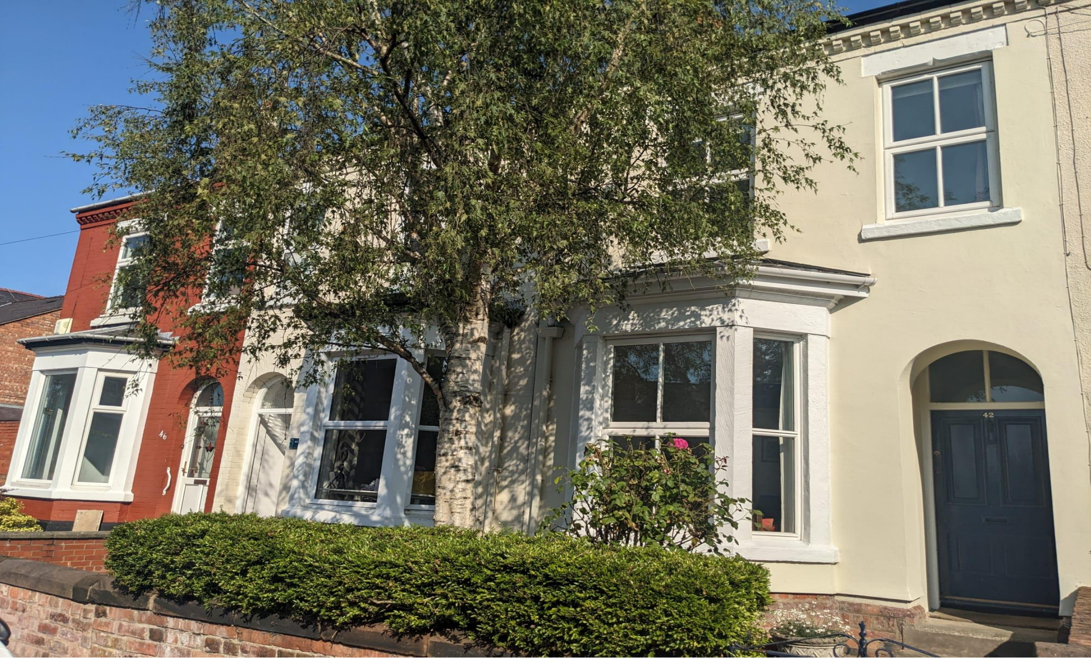
Granville Road, Chester CH1 4DD