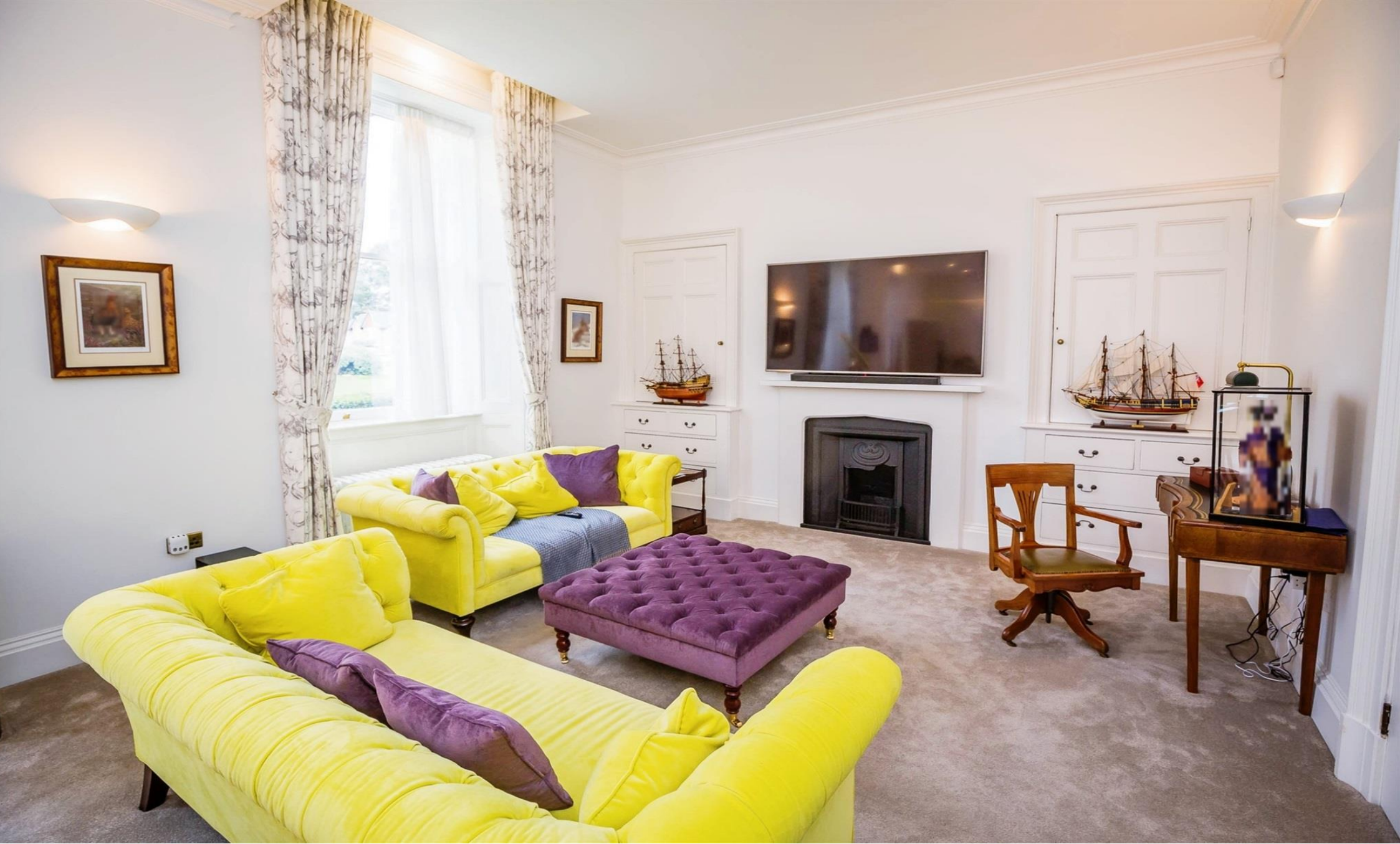
Backford Hall, Blencowe Close, Backford Park, Chester CH1 6QR