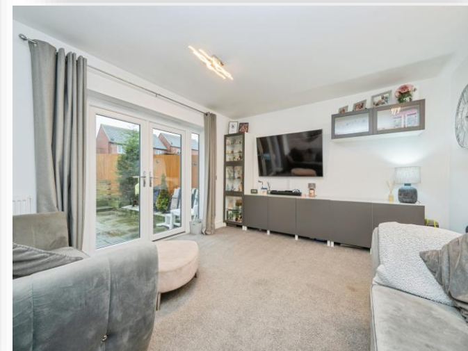
Sampson Avenue, Bramshall, Uttoxeter. ST14 5FG