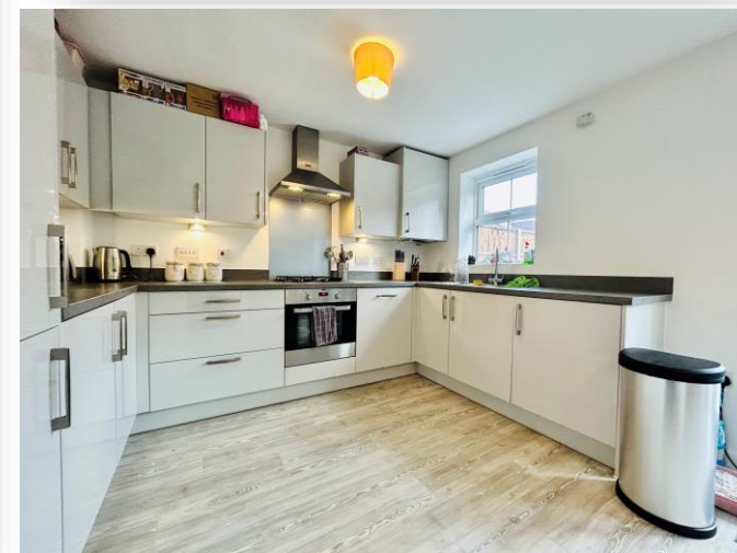
Sorrel Close, Uttoxeter. ST14 8FE