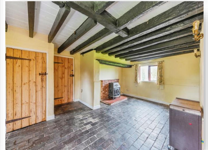
Harts Farmhouse, Pinfold Lane, Abbots Bromley, Rugeley. WS15 3AF