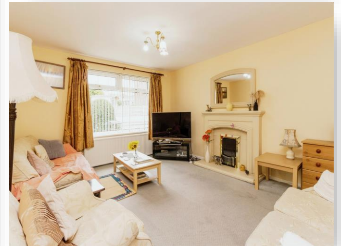
Furlong Avenue, Tean, Stoke-On-Trent. ST10 4JS