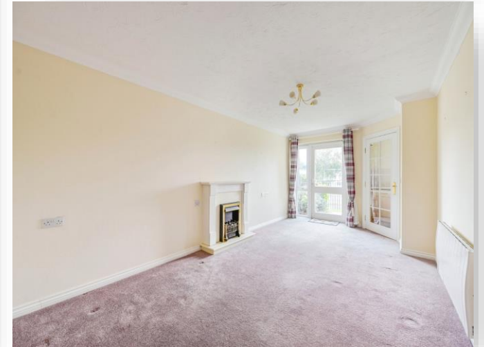
Mellor Lodge, Town Meadows Way, Uttoxeter. ST14 8ES