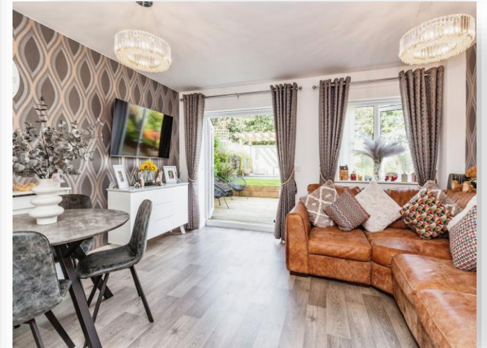
Ivinson Way, Bramshall, Uttoxeter. ST14 5EQ