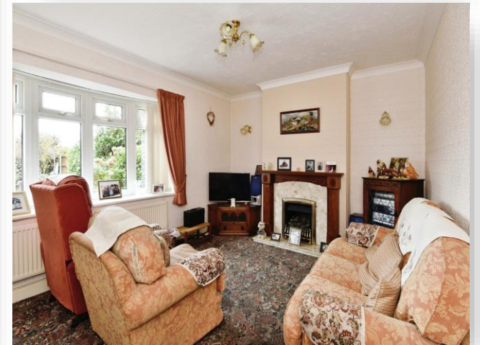
Hawthornden Gardens, Uttoxeter. ST14 7PB