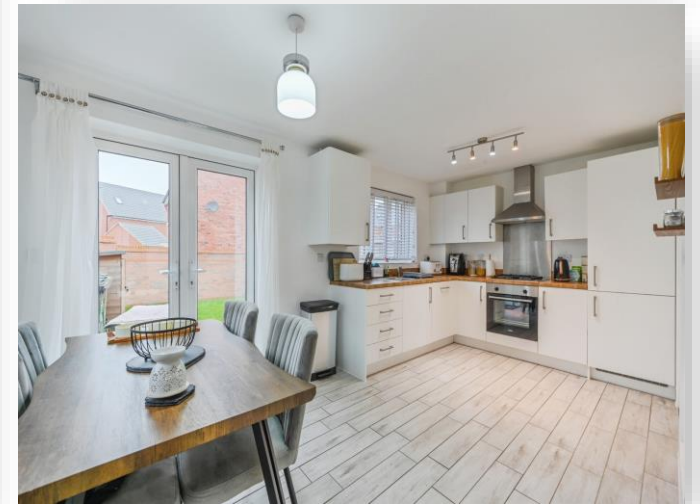
Bridewell Lane, Hatton Derby DE65 5RP