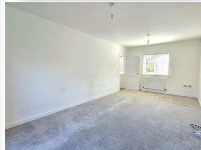
Mint Grove, Mickleover Derby DE3 0GE