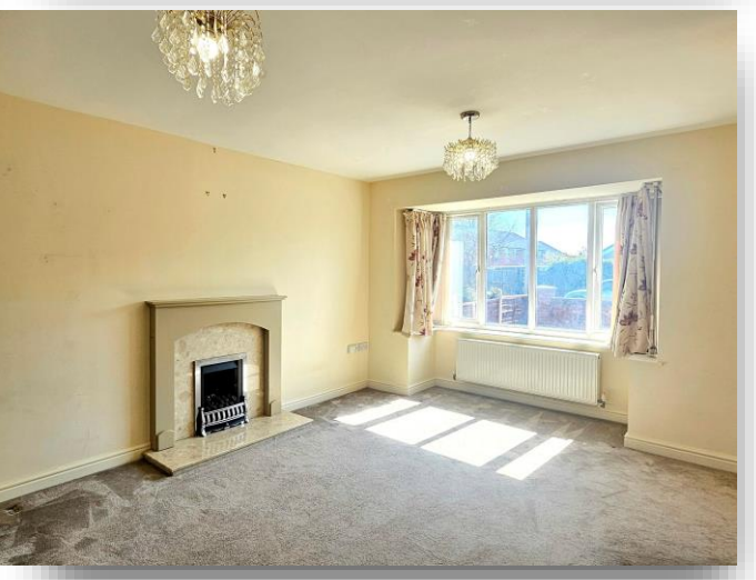
St. Marys Drive, Burton-On-Trent DE13 0LJ