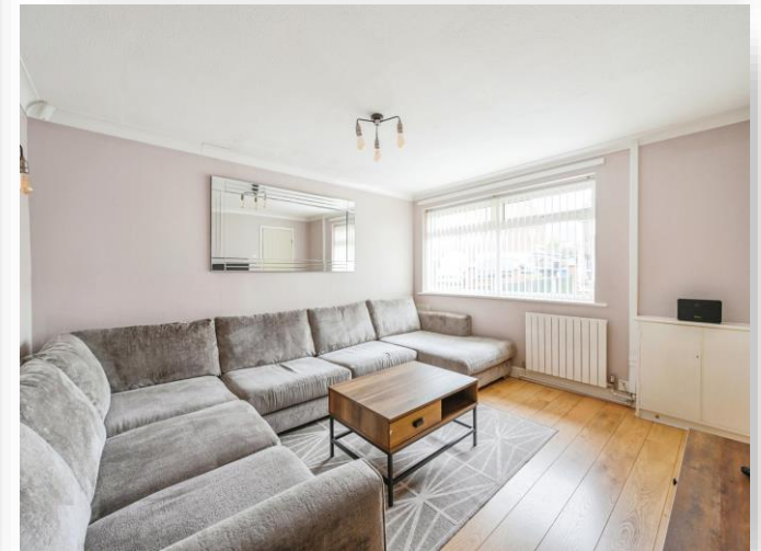
Southgate Close, Mickleover Derby DE3 0QG