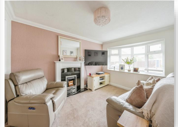
Glenfield Crescent, Mickleover Derby DE3 0RF