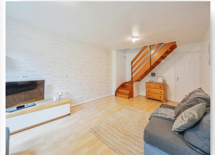
Cumbria Walk, Mickleover Derby DE3 0TL