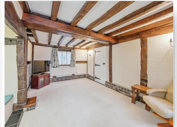
The Black And White Cottage Chapel Lane, Rolleston-On-Dove Burton-On-Trent DE13 9AG