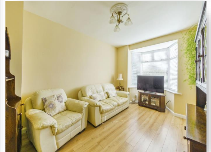
Station Road, Mickleover Derby DE3 9FG