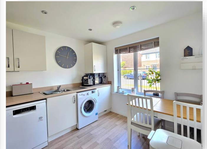
Tutbury Avenue, Littleover Derby DE23 3UX