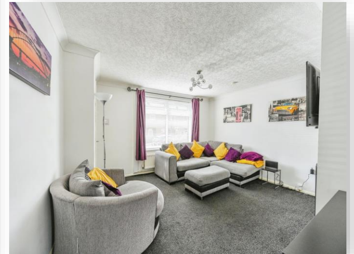
Bretby Square, Littleover Derby DE23 2PF