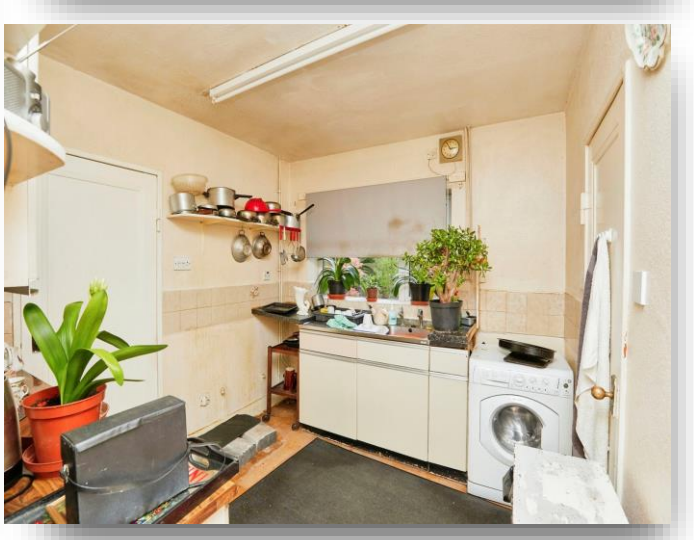
Wilson Close, Mickleover Derby DE3 0DT