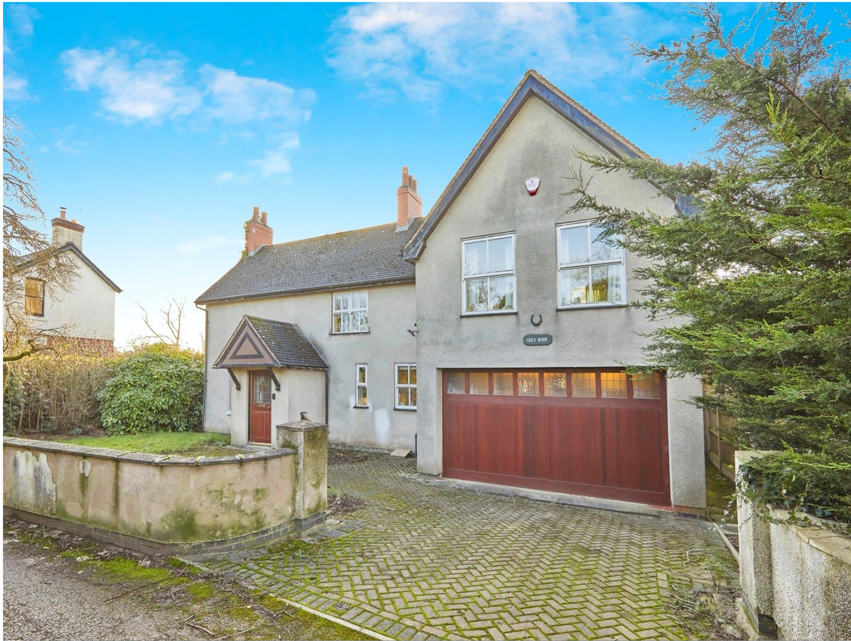
Grey Roof Station Road, Mickleover DERBY DE3 9FB