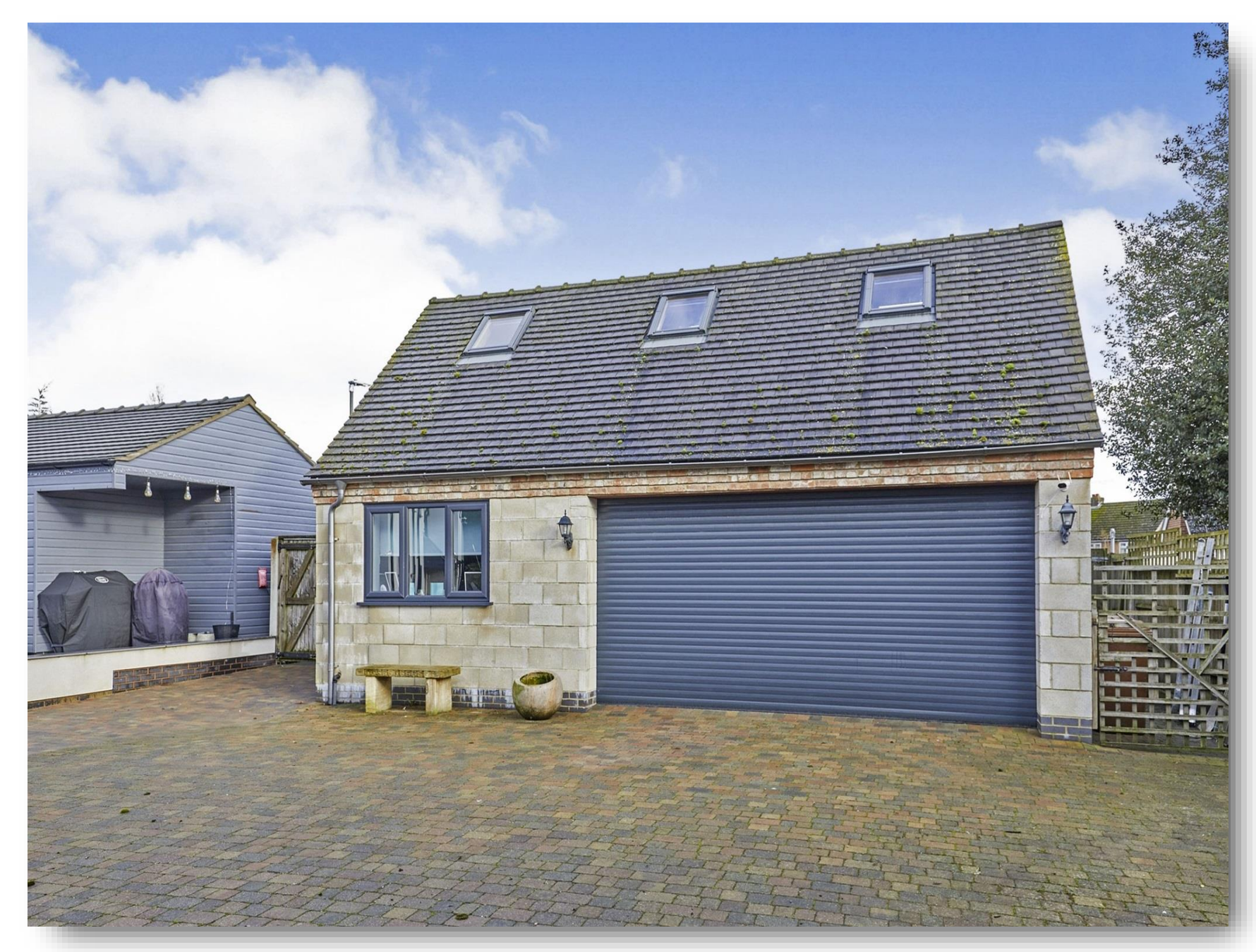
Willowfields, Hilton Derby DE65 5GU