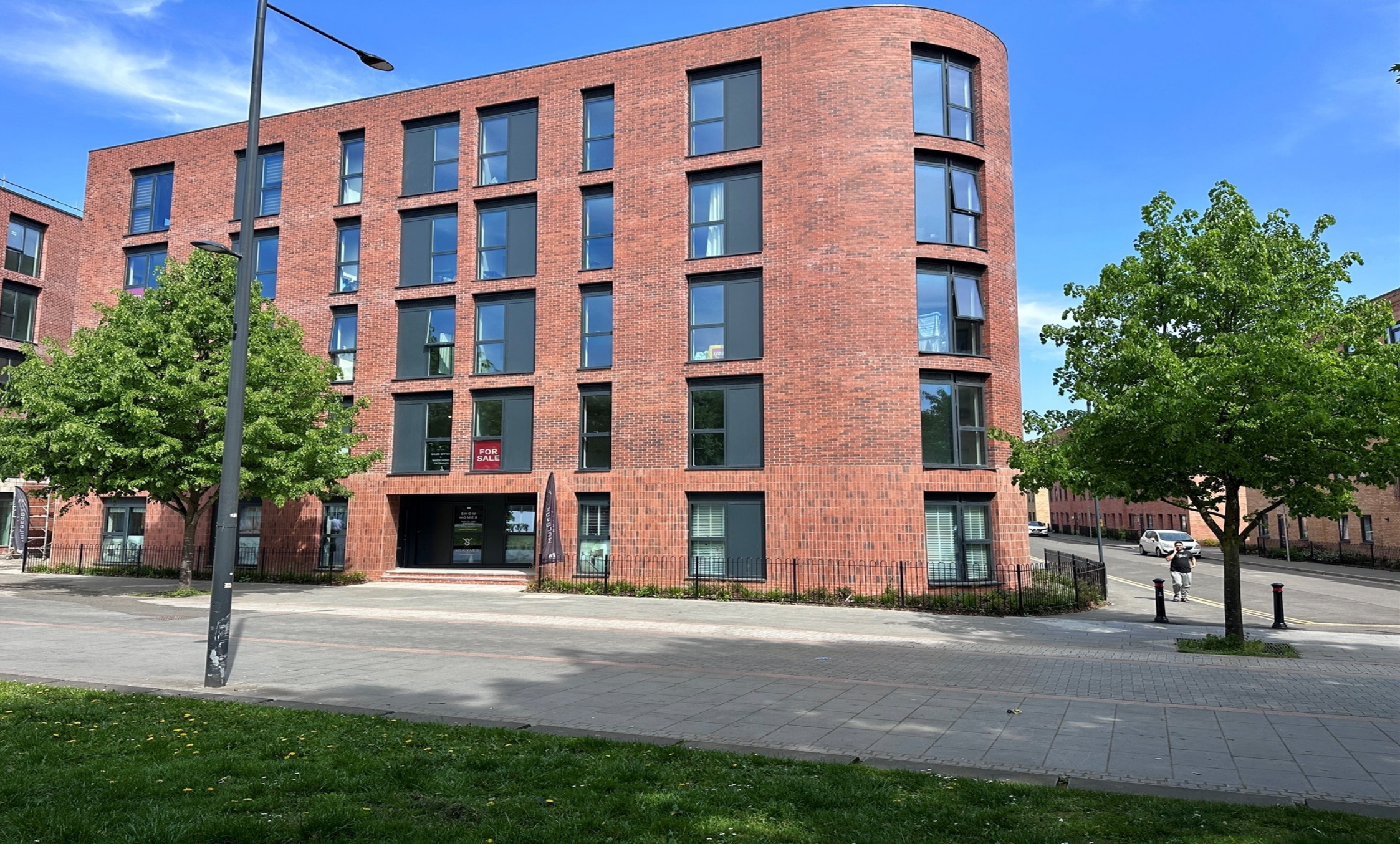
Mulberry House, Liversage Street, Derby, DE1 2LD