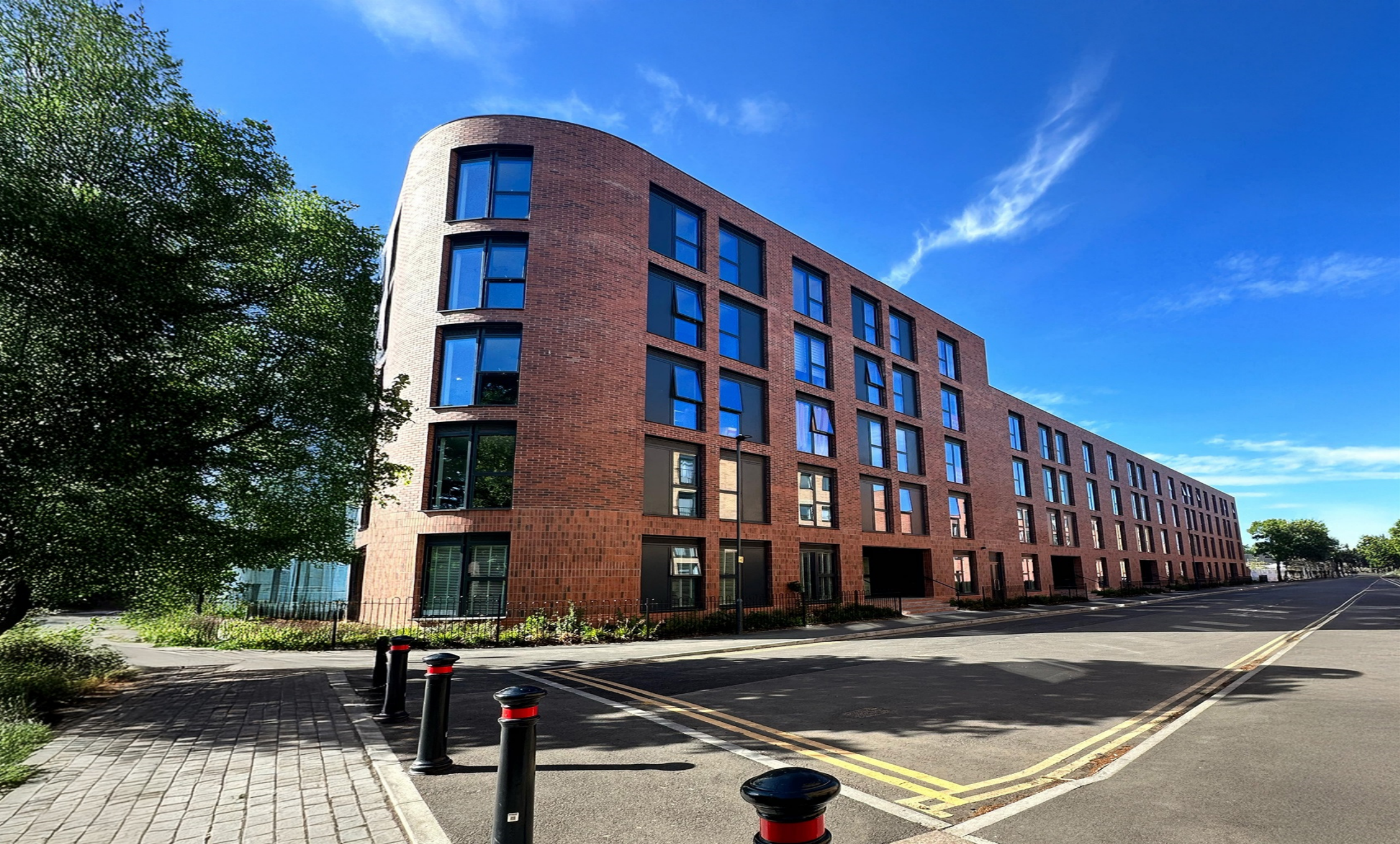
The Silk Yard, Liversage Street, Derby, DE1 2LD