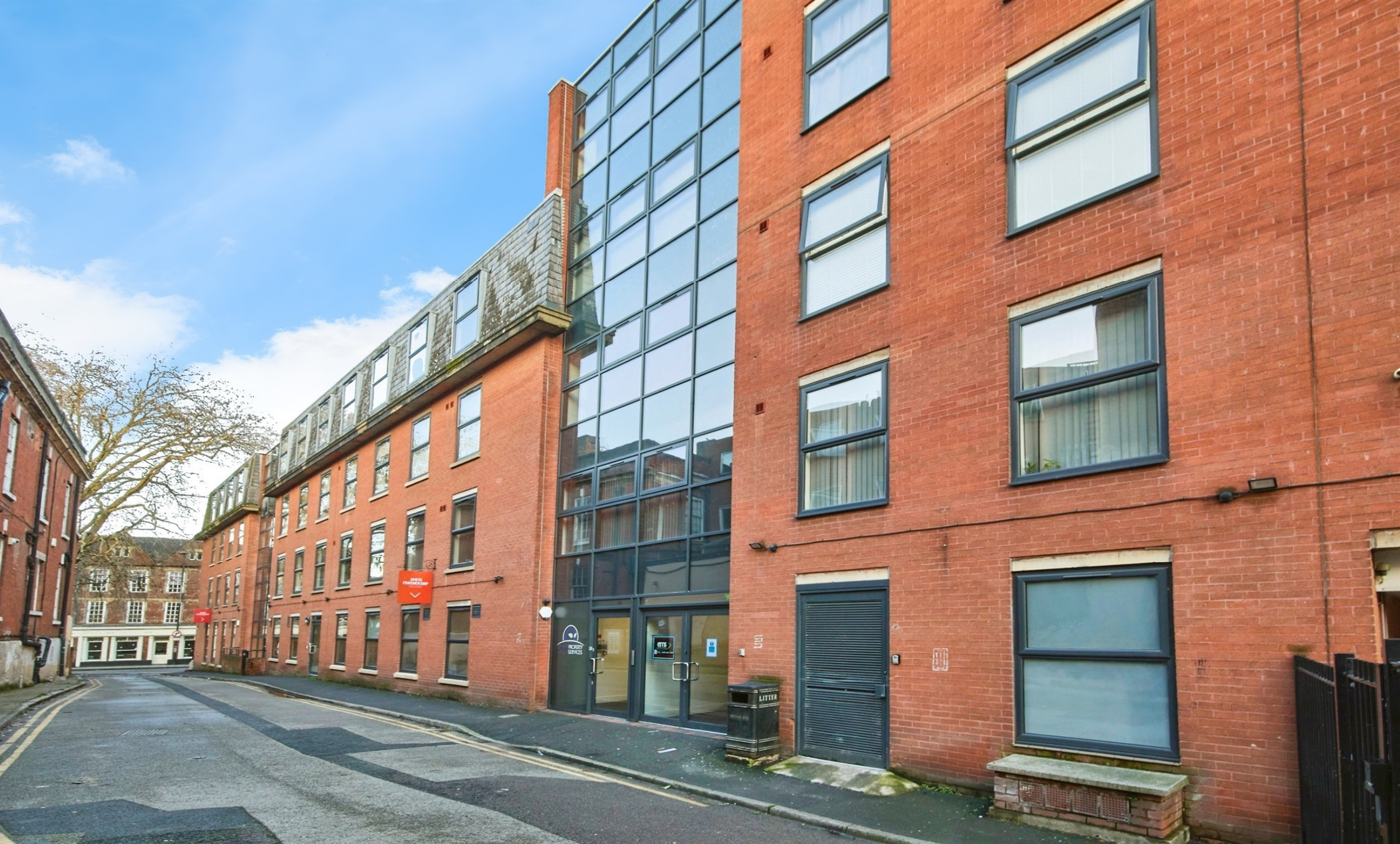
Norman House, Friar Gate, Derby, DE1 1NU