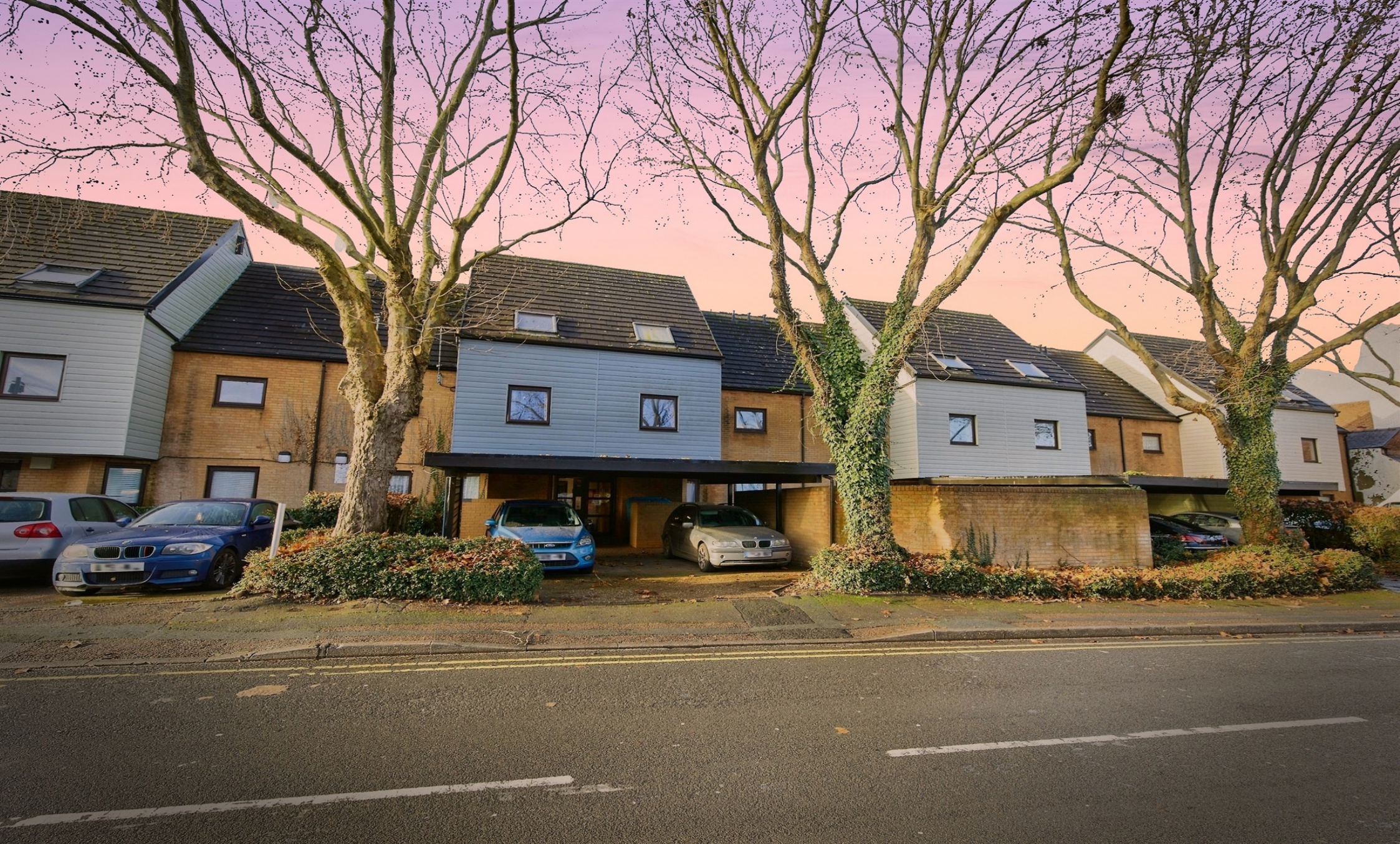
The Maltings, Derby, DE1 2JN