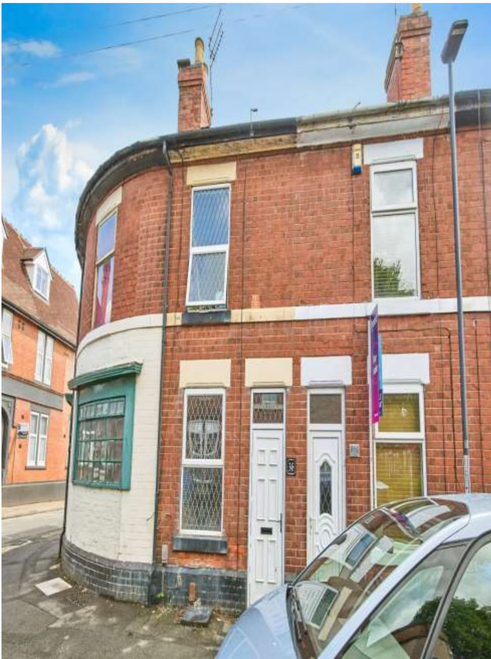
Bakewell Street, Derby DE22 3SB