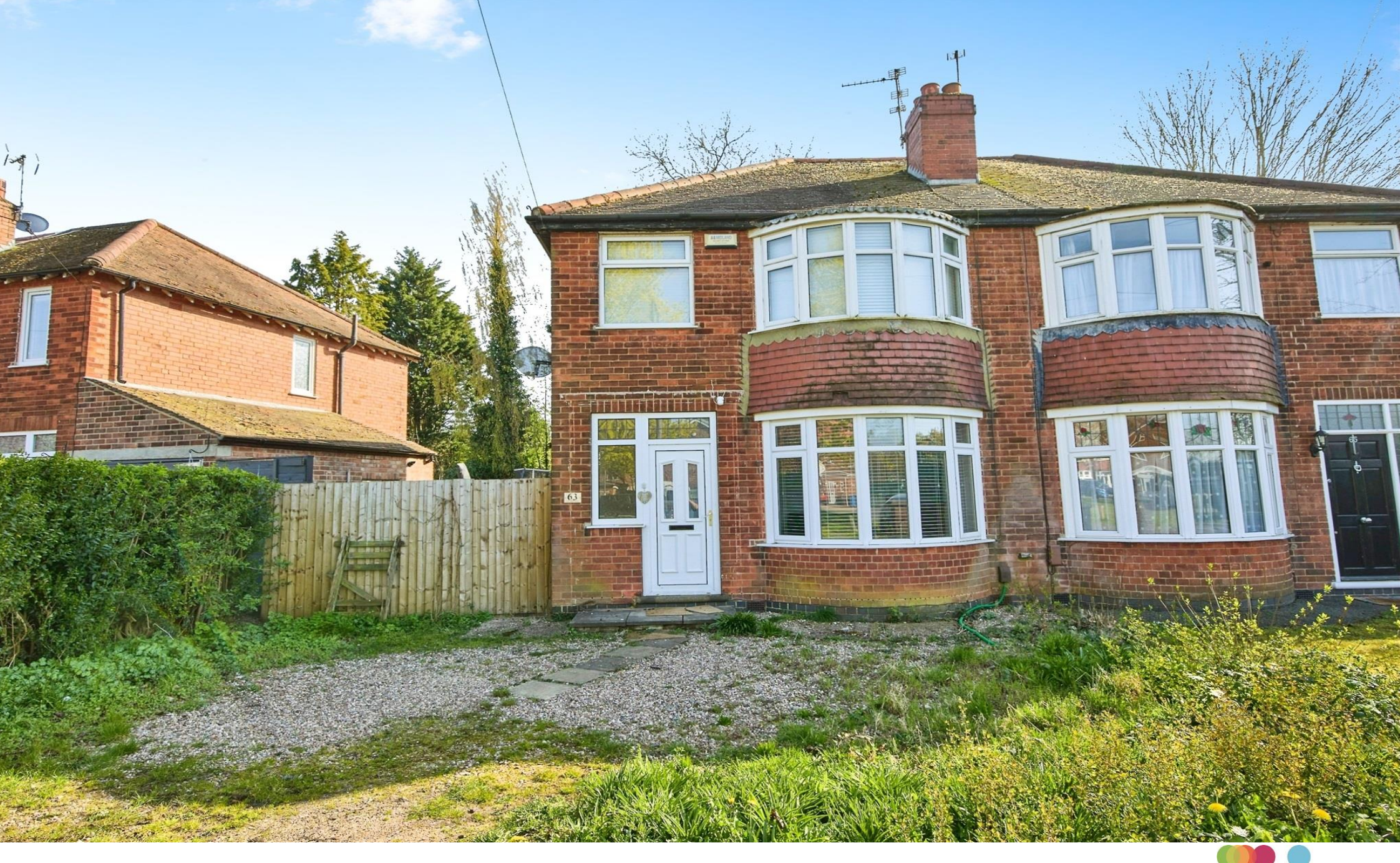
Carlton Avenue, Shelton Lock Derby DE24 9EJ