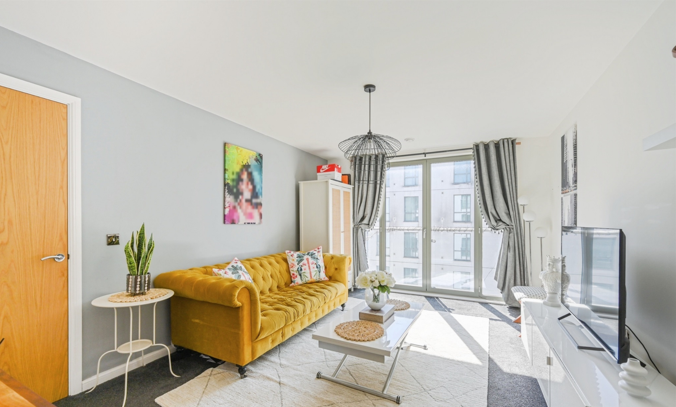
Cathedral View Full Street, Derby DE1 3AF