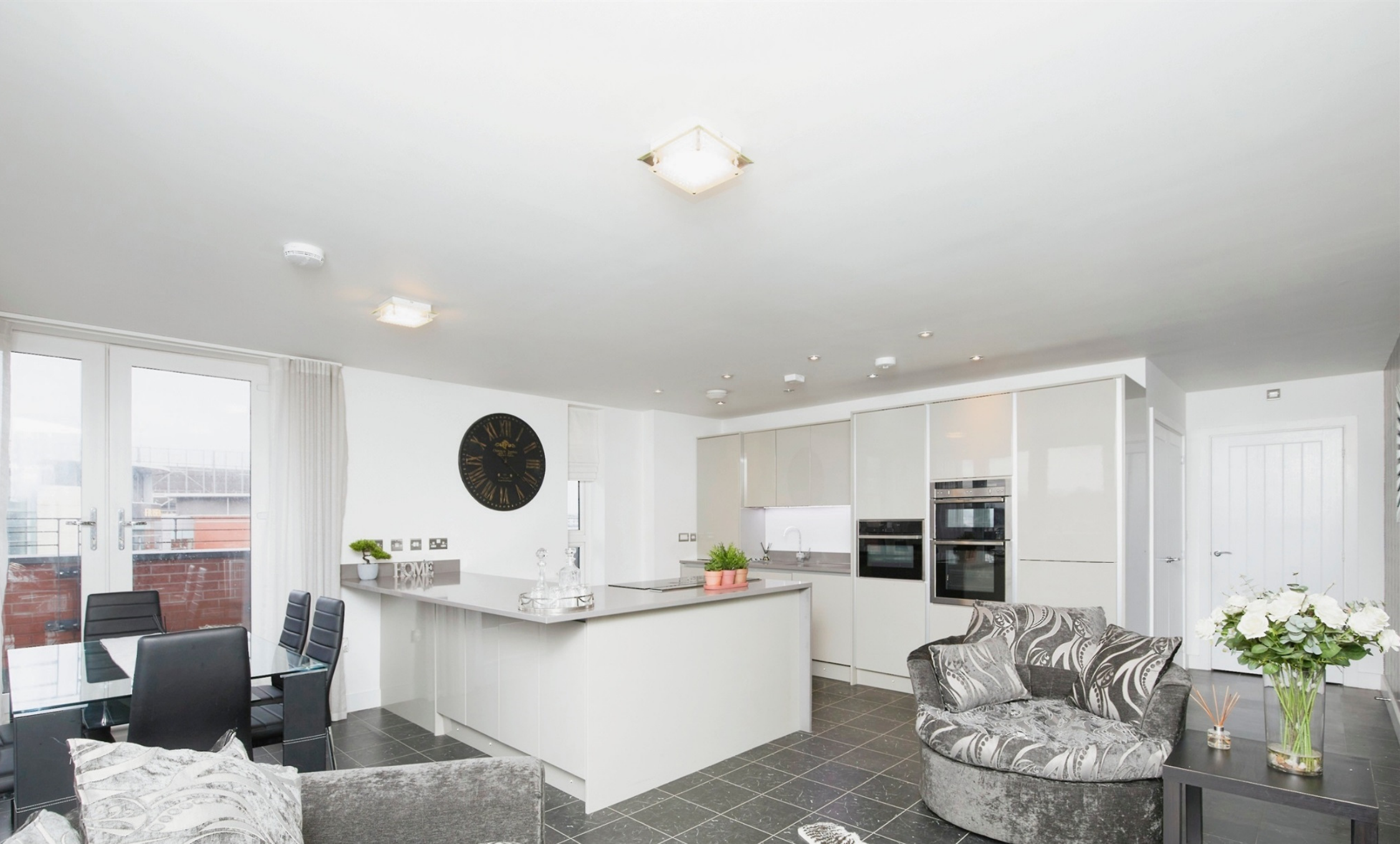
Castleward Court Trinity Walk, Derby DE1 2YJ