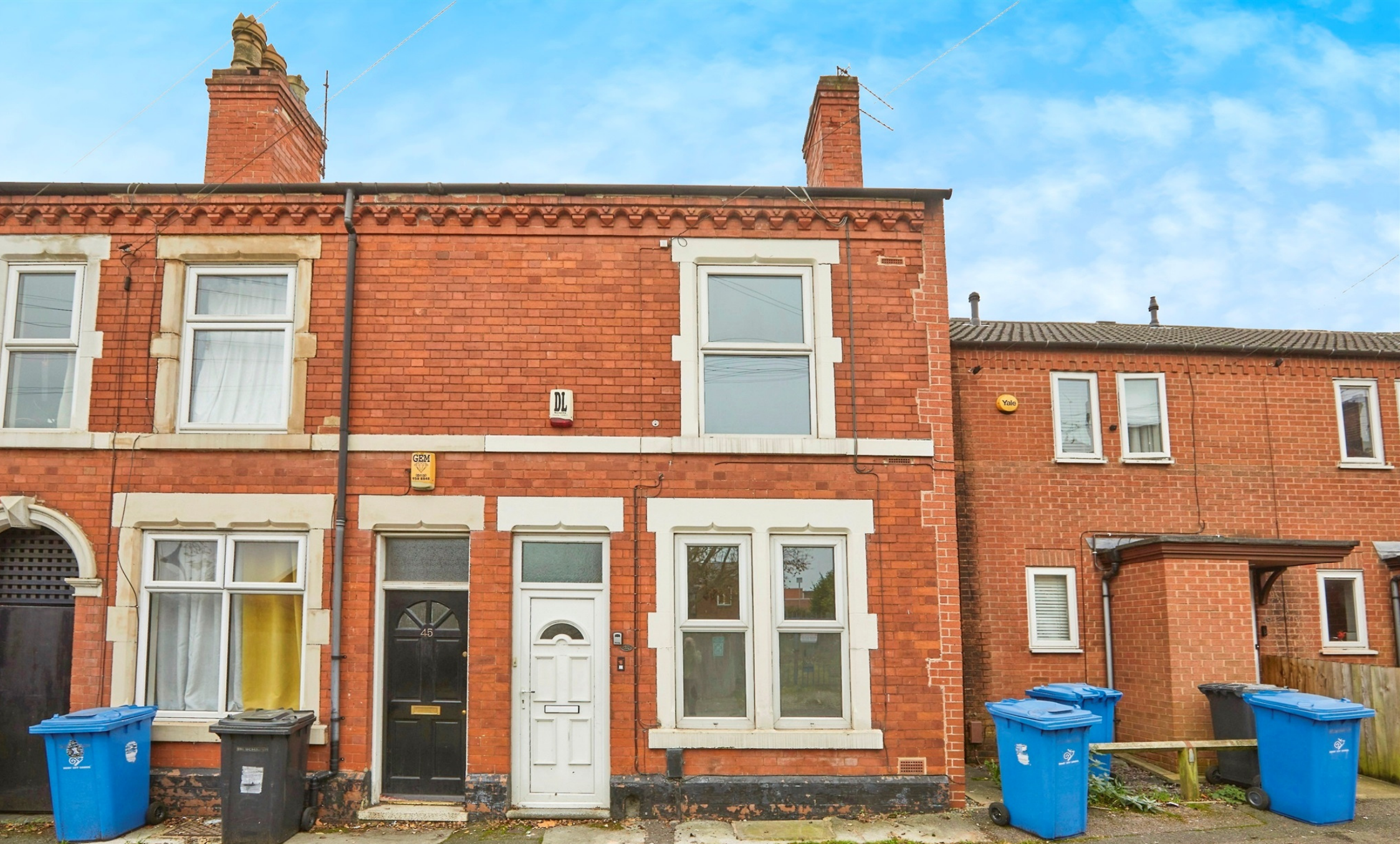
Drewry Lane, Derby DE22 3QS