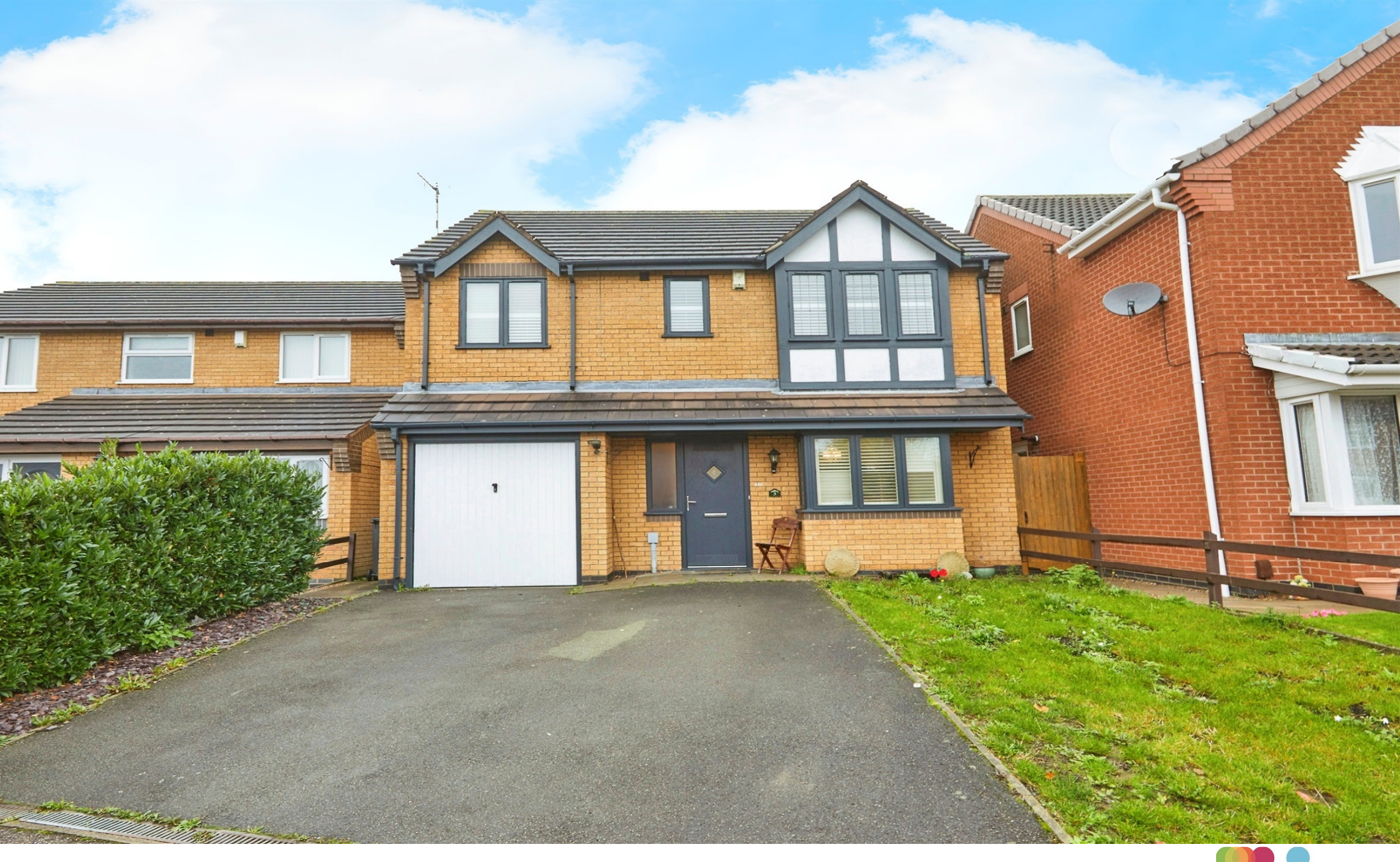
Glenmore Drive, Stenson Fields Derby DE24 3HE