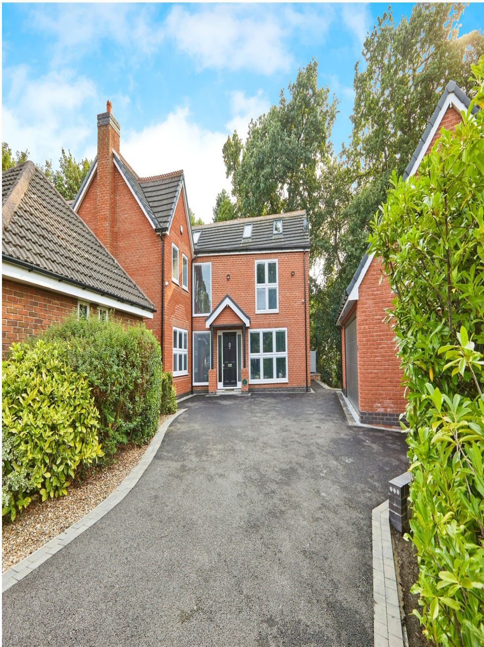
Whittlebury Drive, Littleover Derby DE23 3BF