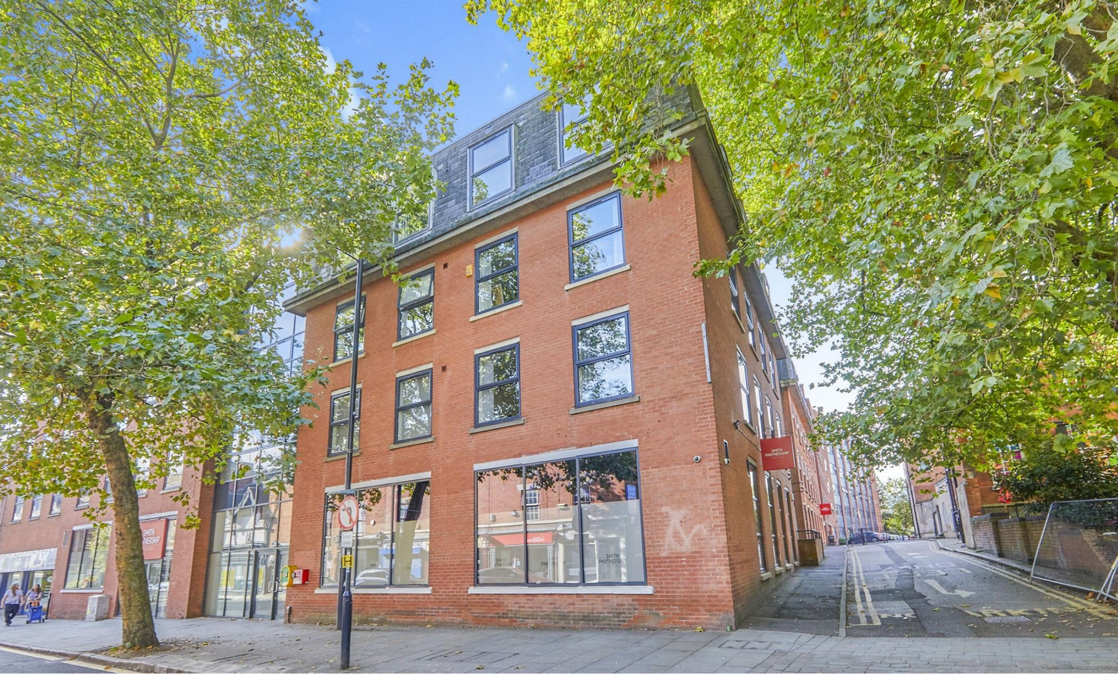
Norman House, Friar Gate, Derby DE1 1NU